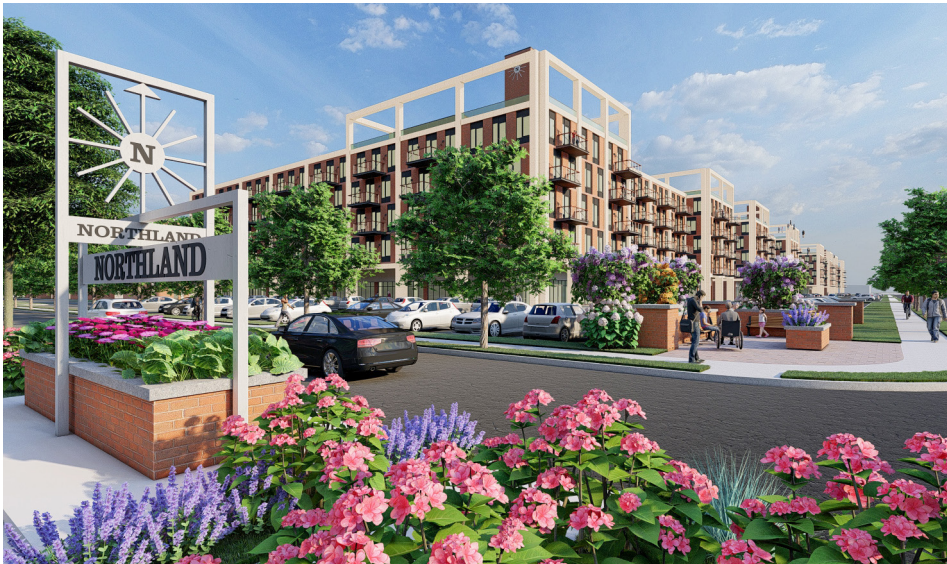
Architect's rendering of five story apartment buildings (with first floor neighborhood retail) facing Greenfield Road. The design mimics that of the former JL Hudson Department Store which will be saved and put to adaptive reuse.

A tentative purchase agreement has been approved by the City Council, pending City Attorney review, for the purchase of the former Northland Mall site. This follows the recent sale of five acres to Ascension Health for an expansion of the Providence Hospital campus.