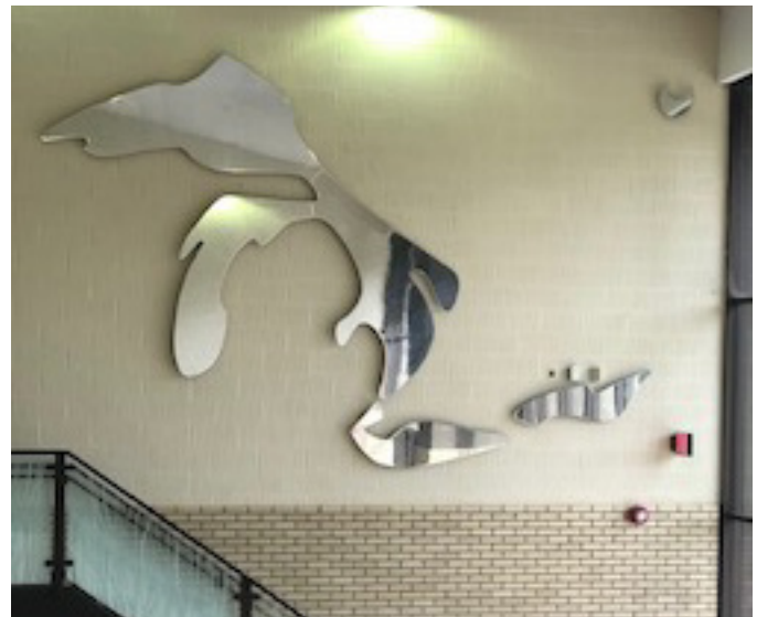
Below: The Great Lakes by Lilian Saarinen from Northland Collection now hangs in the atrium of the Beech Woods Recreation Center.