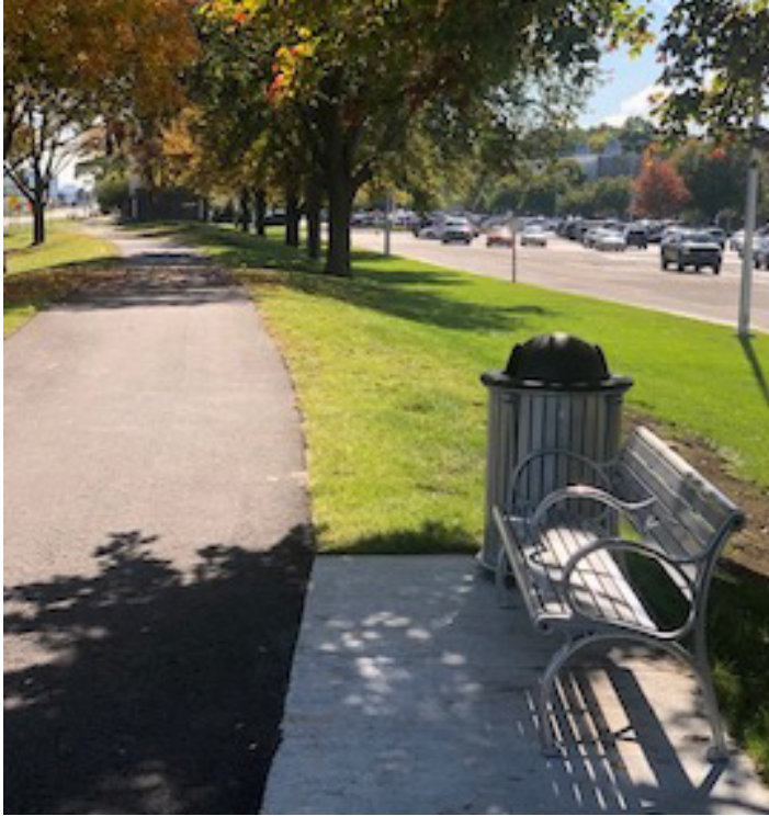
Southfield's newest walking/biking path between Civic Center Drive and Nine Mile will be completed this fall.