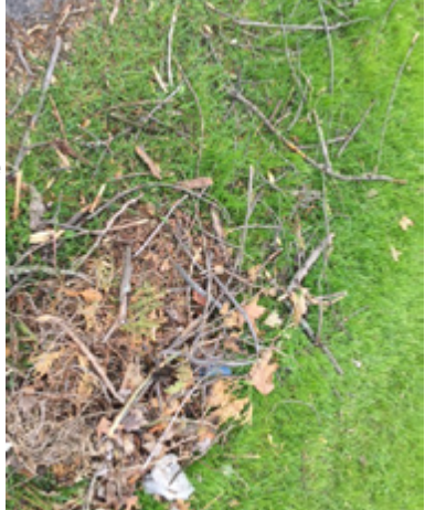
Loose piles of sticks will not be picked up by Public Works. Small sticks jam the chipper.

During the COVID-19 crisis, GFL is currently focusing their available collection capacity on the essential services of municipal solid waste and recycling collection and disposal.