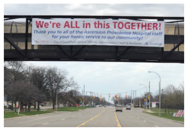
Banners expressing Southfield's appreciation for the Providence Hospital staff went up over the weekend on the pedestrian bridge over Nine Mile.

Branch and brush chipping, performed by Southfield's Public Works Department, continues on the regularly scheduled collection day. Branches and brush refuse must be placed with the cut ends towards the curb on the regular trash collection day. Depending upon