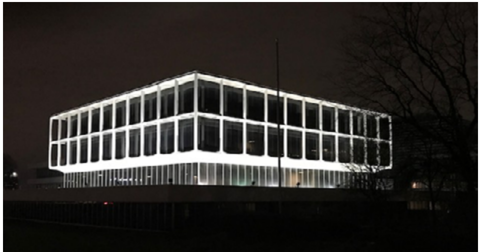
Former Federal Mogul World Headquarters at the corner of Northwestern Highway and Lahser Road is to become the North American Headquarters for global automotive supplier Marelli. This classic Mid-Century Modern office building had been vacant for five years.

Marelli operates 170 facilities and R&D centers across Europe, North America, South America and Asia Pacific and employs 62,000 people worldwide. As Marelli, the unified company is even better positioned to serve customers around the world, by building and diversifying its position in the automotive sector.