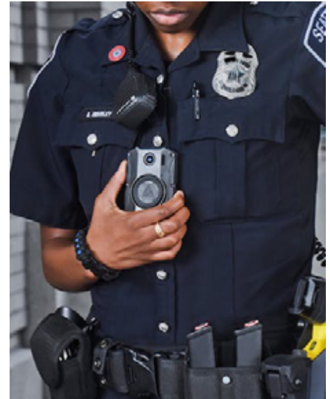
The Axon Body 3 camera

Advanced auto redaction software, which is part of the system, will assist the department in facilitation of evidence gathering.