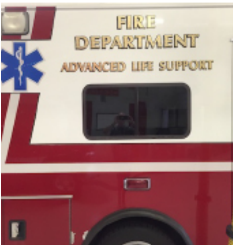
The Southfield Fire Department is one of the busiest fire departments in Oakland County. The vast majority of its service calls are for medical emergencies. The department's vehicles get a great deal of use.

Southfield is committed to ensuring that its first responders are well trained, respond promptly and come to assist with quality equipment that is in excellent condition.