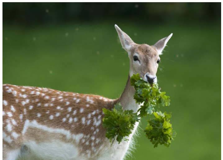
Deer are picky eaters that avoid many plants. Gardeners should cultivate plants deer don't like.