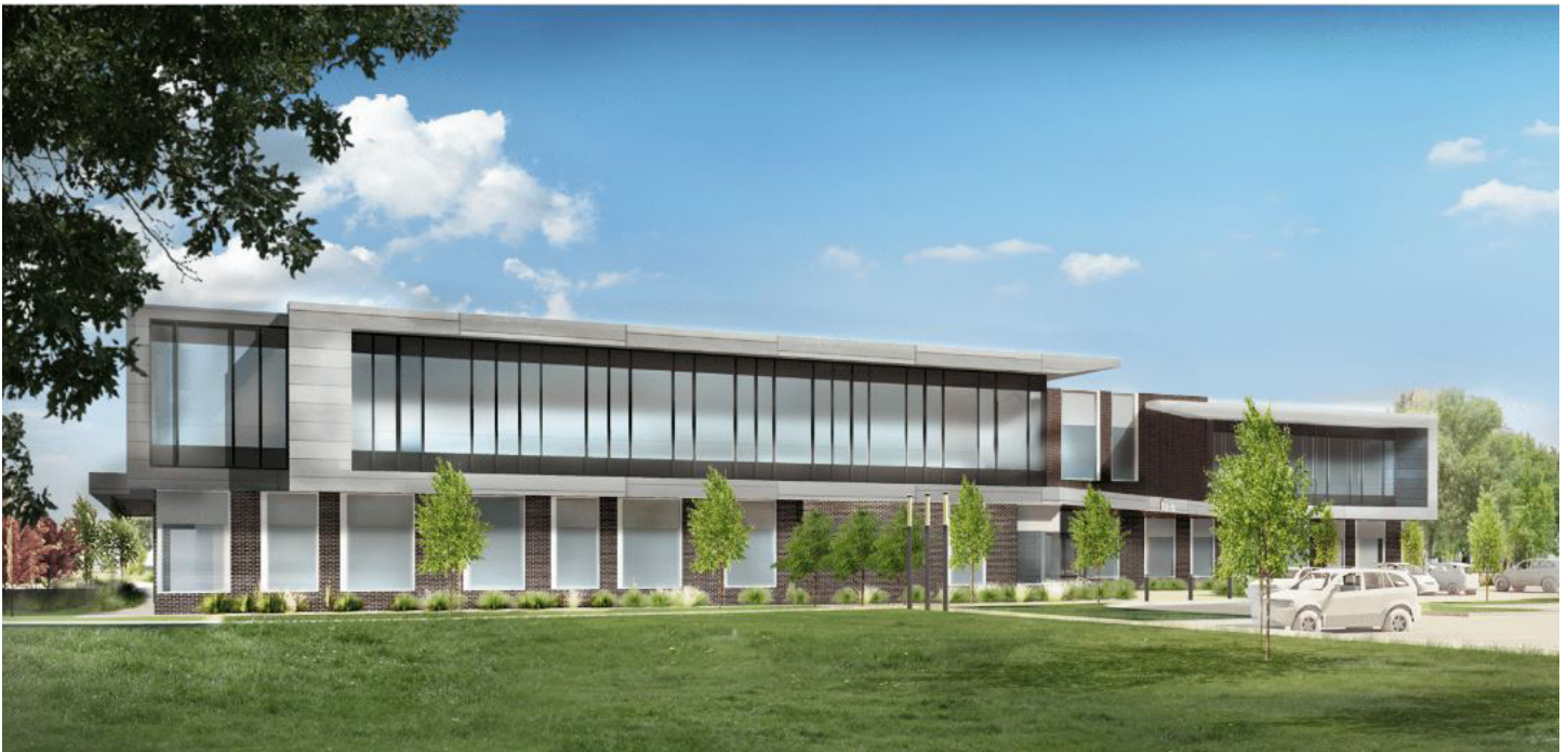
Rendering of the new Truck-Lite headquarters to be built at Civic Center Drive & Northwestern Highway.