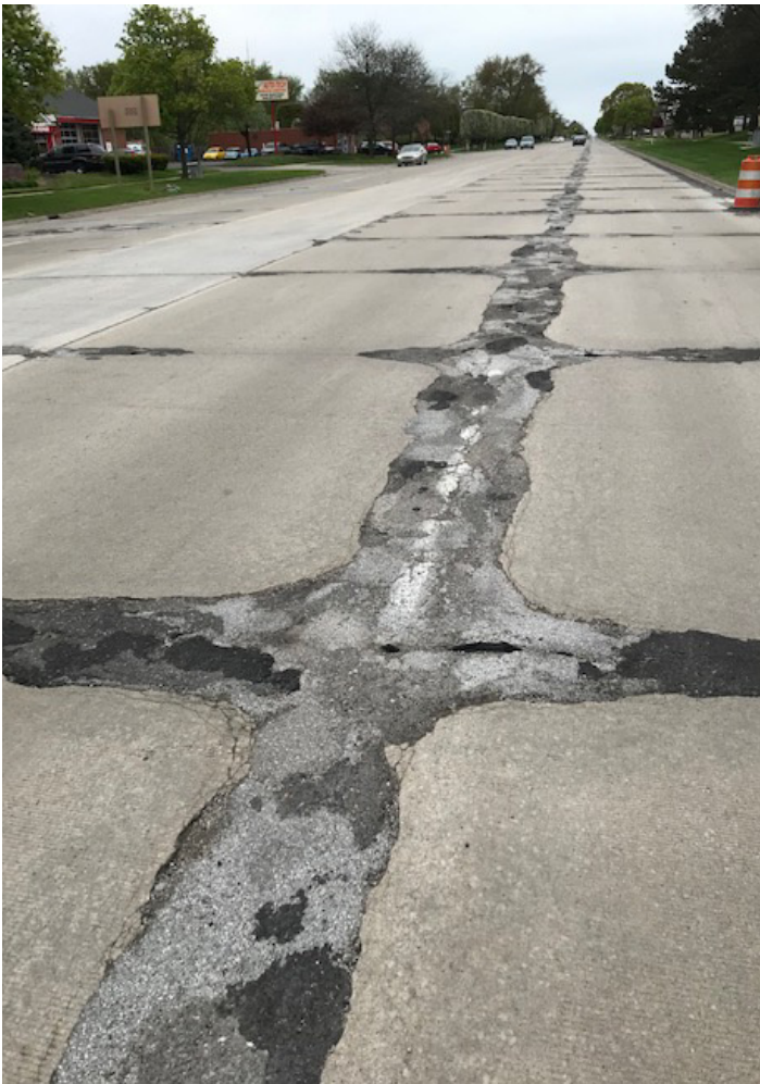
Ten Mile Road, looking east of Evergreen, has been in very poor condition for years. Ten Mile, an Oakland County Road, will have failed sections of concrete replaced this construction season but not a total rebuild. A third of the cost will be borne by Southfield.

The Road Commission of Oakland County will also mill and replace the blacktop on Lahser Road between 8 1/2 Mile Road and Ten Mile. Lahser, Telegraph, Southfield, Greenfield, Eight Mile and Twelve Mile are under county jurisdiction.