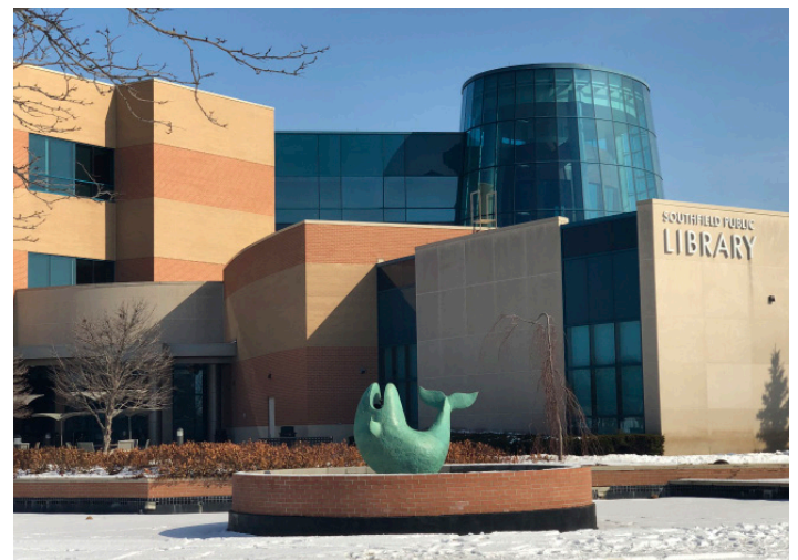
Restored Moby Dick at the Southfield Public Library

Moby Dick was rescued from Northland Center after the mall closed in April 2015.