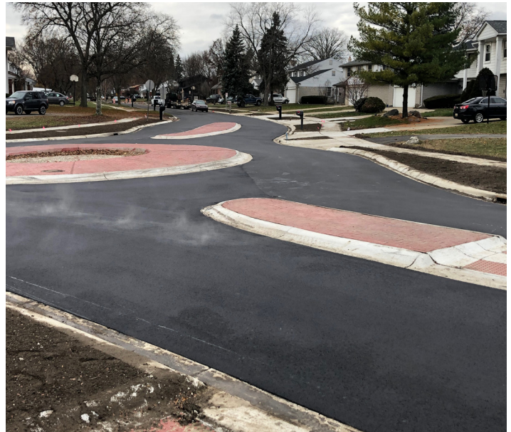
The reconstruction of Winchester Street will be completed with a topcoat of asphalt this spring. Pictured here is the new roundabout at Devonshire.

Both the Nine Mile bridge replacement (between Lahser and Berg Road) and the Northwestern Highway Service Drive between Civic Center Drive and Lahser are expected to be completed before June 30.