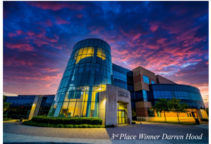
3 rd Place Winner Darren Hood