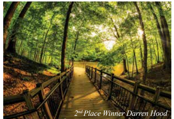
2 nd Place Winner Darren Hood