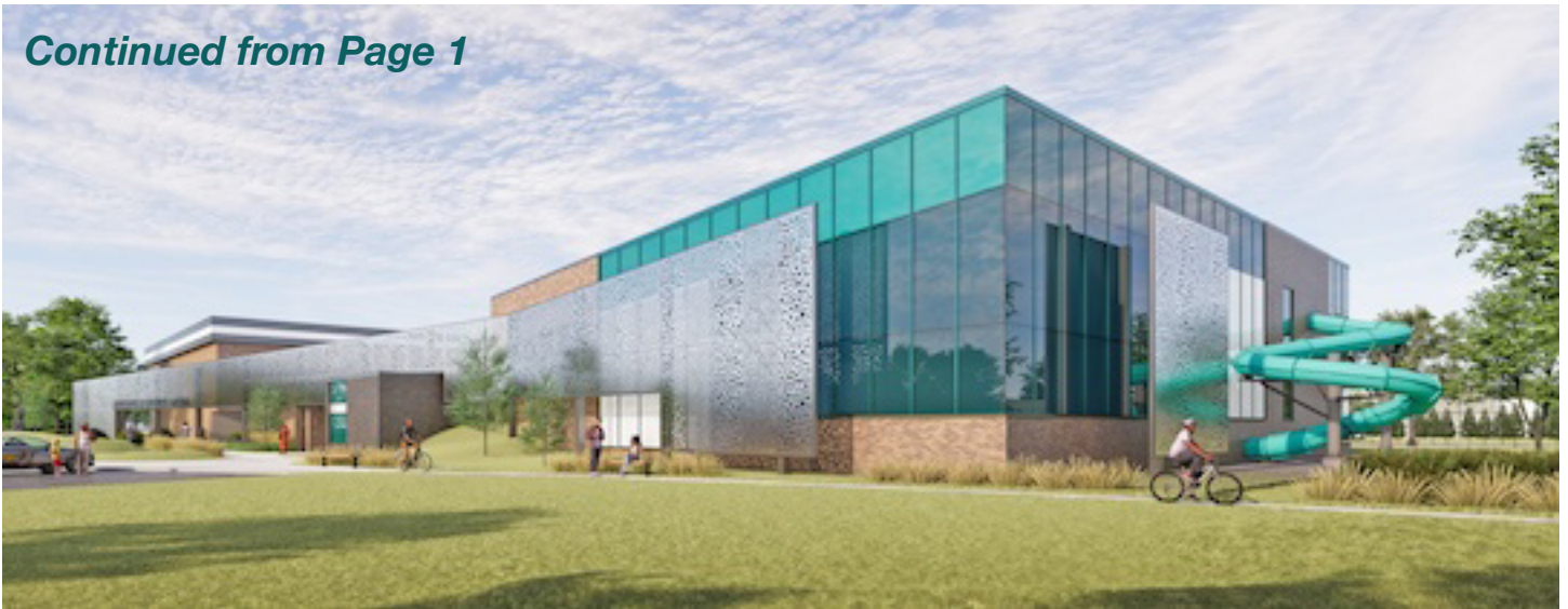
Exterior rendering of new aquatic center to adjoin the existing ice arena on the municipal complex.