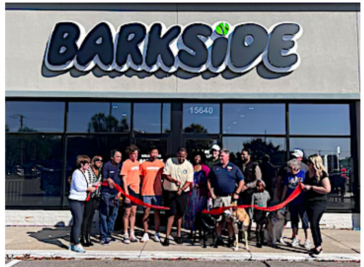
Bar & Dog Park at 11 Mile & Greenfield