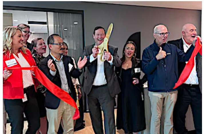
Gresham Smith Architecture 3000 Town Center