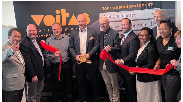
German Auto Tech firm opens office 3000 Town Center