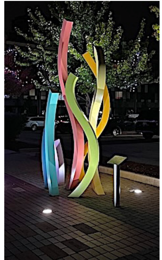
Striving on Central Park Boulevard

The ratings, the report states, are not just a list of winners. “It’s a showcase of what good looks like. Further, it is a celebration of beauty, vision, and civic excellence.” Metro Marvels spotlights the shared belief that well-designed, well-loved communities have the power to uplift people, strengthen local pride, and drive lasting change.