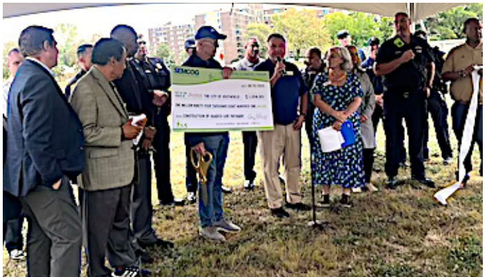
Ribbon cutting celebrating the completion of Northland area road replacements--North Park Drive, Foster Winter Drive & Rutland--and the receipt of a $1.09 million grant from SEMCOG for the 9 Line pathway that will eventually connect to Northland City Center.