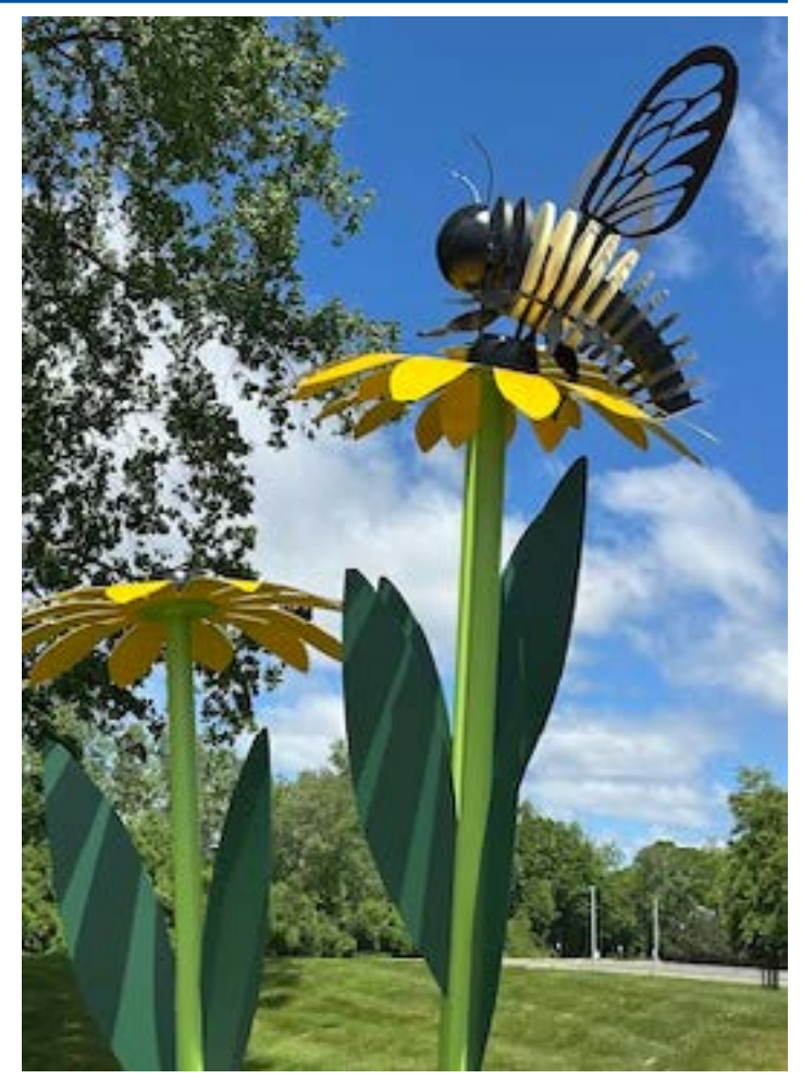
Southfield's newest public art installation is the Bumble Bee on the Northwestern Highway Pathway.

Southfield has over 20 miles of urban pathways.