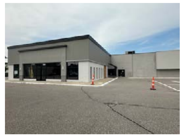
Future home of Barkside at 15640 W. 11 Mile & Greenfield