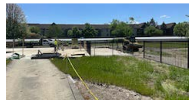
Southfield's first municipal dog park is under construction at Lahser Woods Park

Lighting and benches will be added to the Promenade. It will be able to bear the weight of food trucks and portable stages. Many times the lawn does not drain well causing ruts and soggy spaces. It also may alleviate having to close Evergreen Road for smaller events.