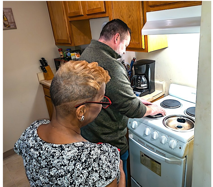
Volunteer installs SmartBurner while a Woodridge resident looks on. Installation took only minutes to switch out burners. The heating element switches off when overheated.

Nationally, cooking fires are the leading cause of household fires. For aging populations, the risk of death in these fires only increases. Over the past four years, Chief Meniffee reports, the Southfield Fire Department responded to 165 kitchen fires. Several of these fires resulted in death and significant property