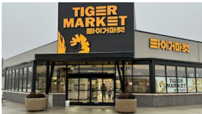
Tiger Market, on Northwestern Highway at Telegraph, is adjacent to New Seoul Plaza

Costco has hired 51 people from the community and Tiger Market, 17.