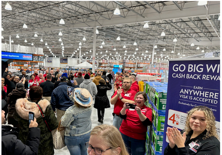
On opening day, customers stream into Southfield's Costco at 7am

Southfield Costco shoppers will not find a bakery, deli, liquor shelf, or gasoline station at this location. There are also fewer varieties of some products as this Costco is geared toward supporting convenience stores, restaurants, and hotels.