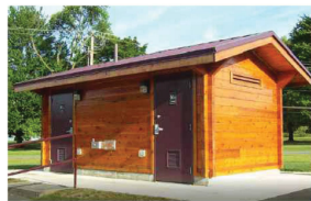
ANALOGOUS PHOTO — SEE PLAN FOR PROPOSED LAYOUT AND ELEVATIONS FOR PROPOSED COLORS