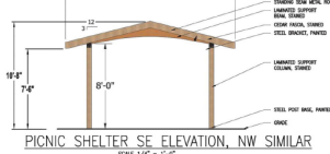
PICNIC SHELTER SE ELEVATION, NW SIMILAR SCALE 1/4" = 1'-0"