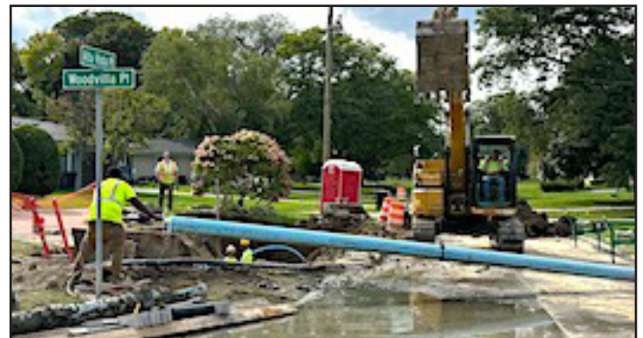
New water mains being installed at Woodvilla & Alta Vista

Mill and overlay of black top on Friar Lane, Ravine, Edgemont (north of Ten Mile), Lindenwood Lane,