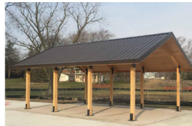
ANALOGOUS PHOTO — SEE ELEVATIONS FOR PROPOSED COLORS