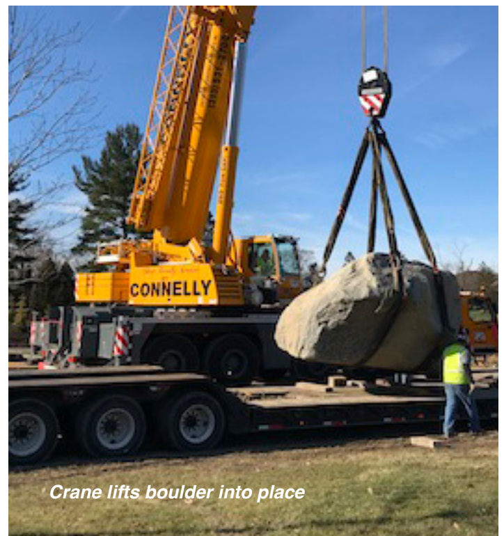
Crane lifts boulder into place

Earlier this year interpretive signage was placed in the Boulder Garden to explain the rocks and minerals placed in the installation and where they came from. The Boulder Garden has become immeasurably popular with children.