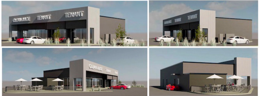
Makeover coming to obsolete strip center on Northwestern Hwy.

The small strip center on the west side of Northwestern Highway near Twelve Mile Road will receive a total renovation and a drive-thru will be added to the north elevation of the structure.