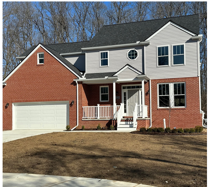
New home backs up to Inglebrook Park

SF Community Development has partnered with Contour Companies for the development of 40 mid-priced condominiums on George Washington Ave. Conversion of the former McKinley School to 18 unique units with two-car garages has begun. Eleven, two-family detached English Tudor homes will be built on the former school's playground.