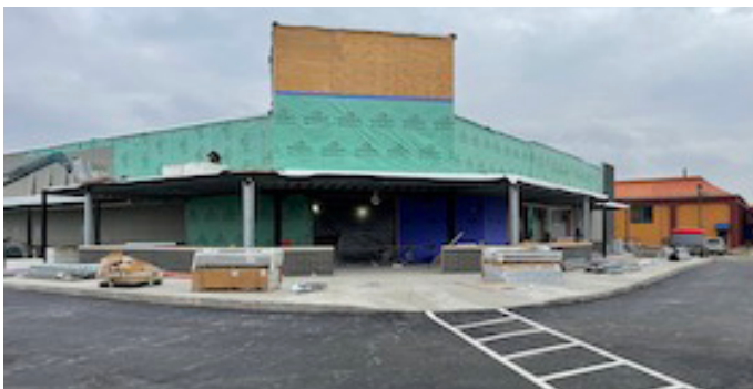
Popular Korean restaurant New Seoul Garden is adding a gourmet market next door.