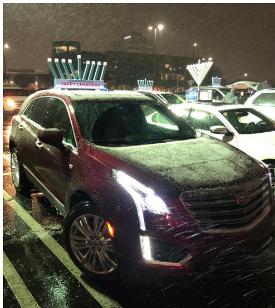
Cars line up for the Chanukah parade.

Originally instituted as a pandemic safety measure, the parade has become popular with Southfield residents.