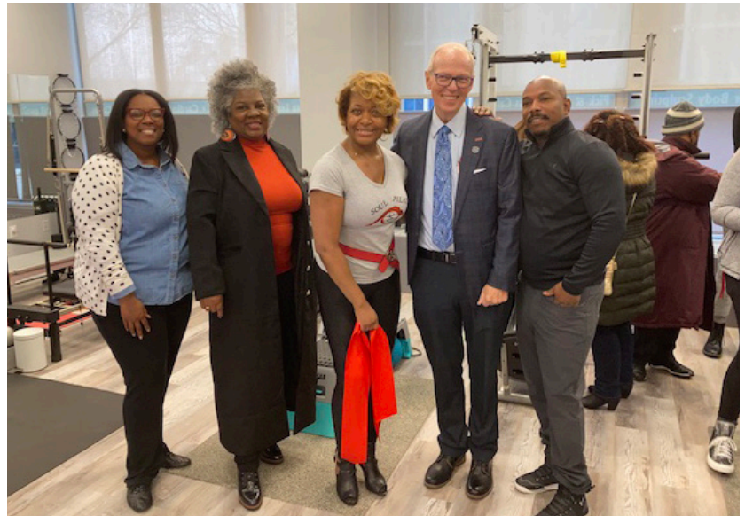
Natural U Health & Beauty Salon 15565 Northland Drive, Suite 101W Skin & body sculpting, fitness training