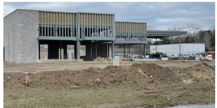
Enterprise Rental Car continues growth in Southfield with its third expansion at Telegraph & Garner streets.