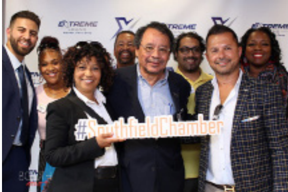
EXtreme Loans 29444 Northwestern Highway Mortgage financing