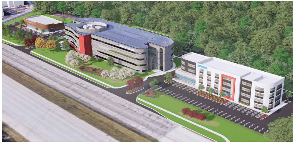
Rendering of the proposed adaptive re-use of the former Victor Office building on Northwestern Highway (center) with a medical office building and an assisted living center. Rezoning is pending for this development.

Unrelated, but another sign of improvements in the area are the construction of a new gourmet market on the former Copper Canyon Brewery site and the conversion of a five-story, former hotel building behind the Best Western Premier Hotel on Telegraph at I-696 and the Lodge Freeway.