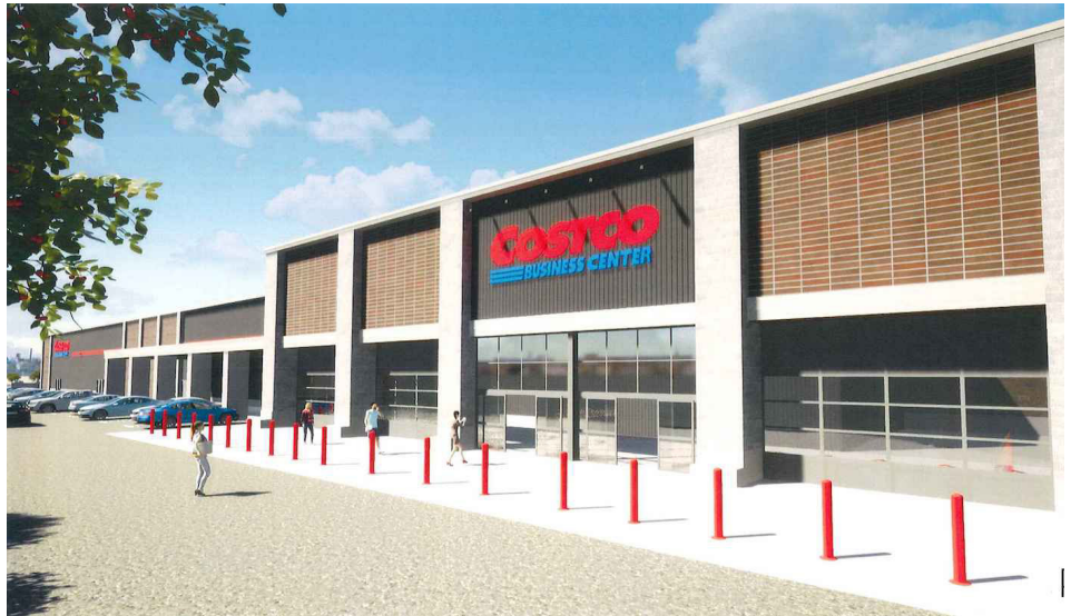
Rendering of Costco Business Center coming to the Northland redevelopment. BELOW: Rendering of Tesla Service Center planned for Telegraph Road, the first in Michigan.