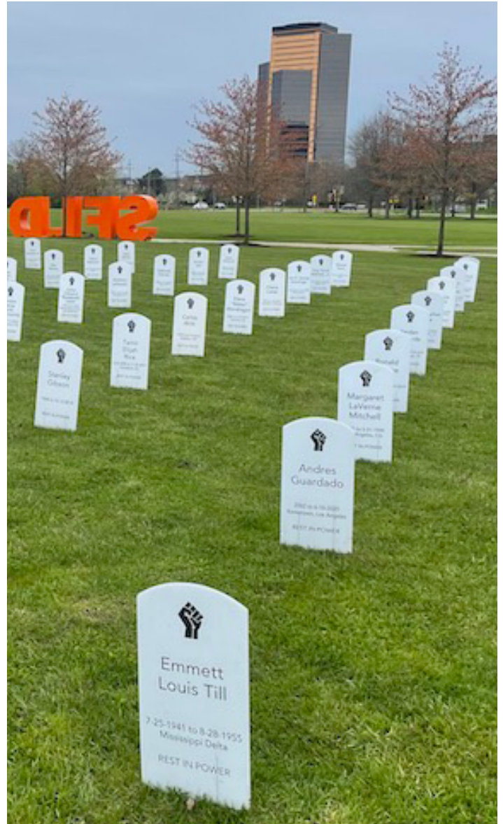
Remember Them display - Sept.23 - Nov. 23

The installation is open every day from dawn until dusk until November 23. For more information, contact the Mayor’s Office at (248) 796-5100 or visit www.cityofsouthfield.com .