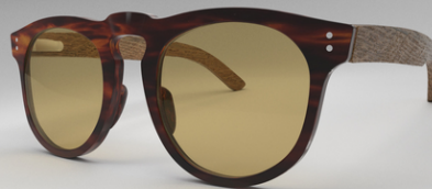
Below: Traps Eyewear frames designed with coastal character and crafted in collaboration with Botzen Design and Making.