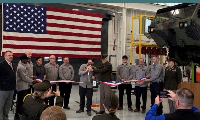
The official ribbon cutting ceremony for AMSA 134 with the U.S. Army Reserve took place in Southfield on April 16.