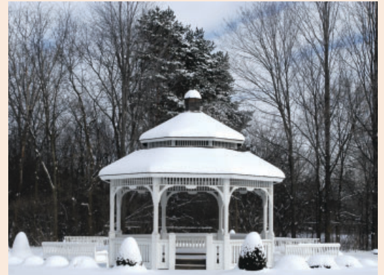
Winter at the Burgh Historical Site