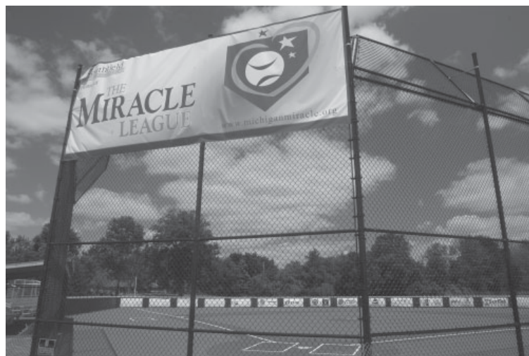
The newly completed Miracle League field at the Southfield Municipal Complex.

The first specially-equipped field called the "Field of Dreams" was built in Atlanta, Georgia in the spring of 2000. This custom-designed venue incorporates a cushioned synthetic turf that accommodates wheelchairs and other walking assistance devices, while helping prevent injuries. In other words, it provides a level-playing field where physically and mentally challenged children can hit, run, and catch - just like the best of them. During each Miracle League game, every child is given an opportunity to hit the ball and score a run. Miracle League team members are assigned "buddies" who assist them in hitting the ball and "running" the bases. Buddies can be fellow schoolmates, parents, college students, business leaders or anyone who wishes to volunteer their time to give a child the gift of baseball. For more information, call the Miracle League at (248) 506-4604.