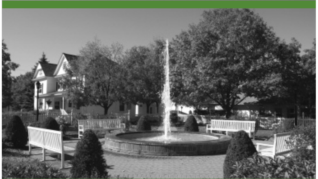
Southfield Human Services is located in the Burgh Historic Park at 26080 Berg Road (& Civic Center Drive)

representatives of the community who volunteer their time for the purpose of making Southfield the