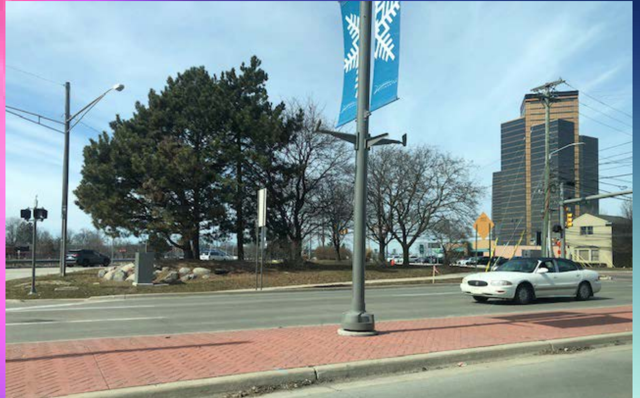
View from Evergreen Road looking west

Southfield Public Arts Commission & Friends of Southfield Public Arts