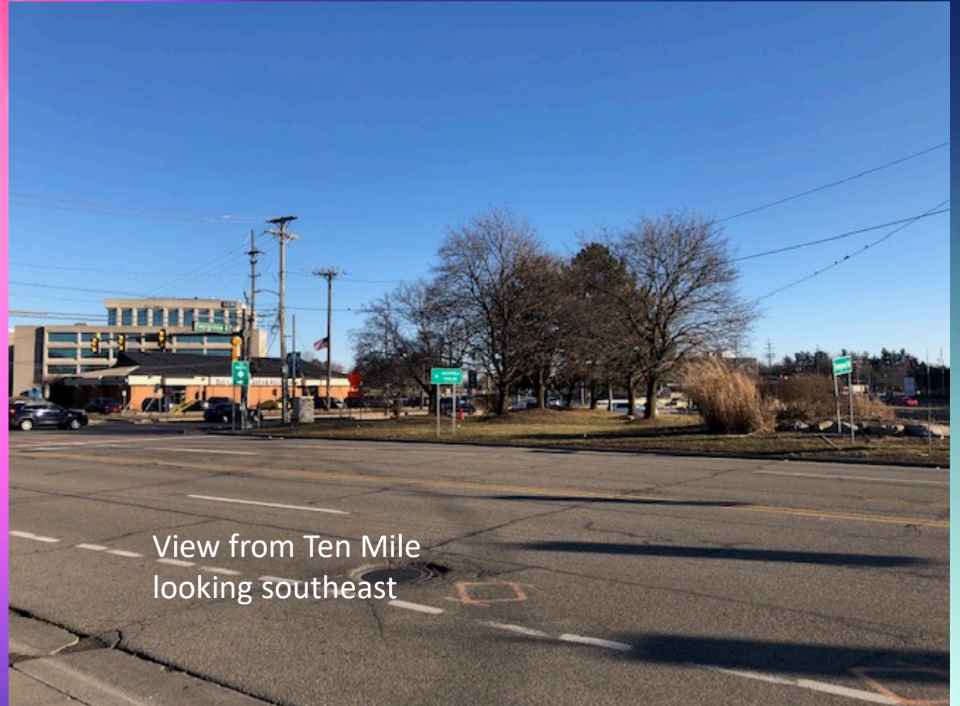
View from Ten Mile looking southeast

Southfield Public Arts Commission & Friends of Southfield Public Arts