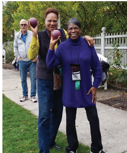
Our Southfield team won the Bocce Tournament!

Another fantastic Mackinac trip with Senior Services and mParks is in the books! Want to check out the fun we have for yourself? See page 4 for all the details on the 2023 trip!!! Registration begins January 3, 2023.