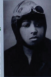
Bessie Coleman 1892-1926

50 informational signs about influential African Americans throughout Southfield and world history