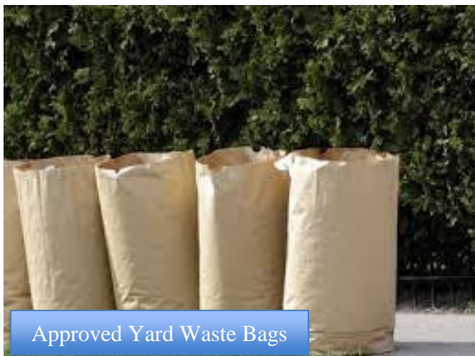
Approved Yard Waste Bags