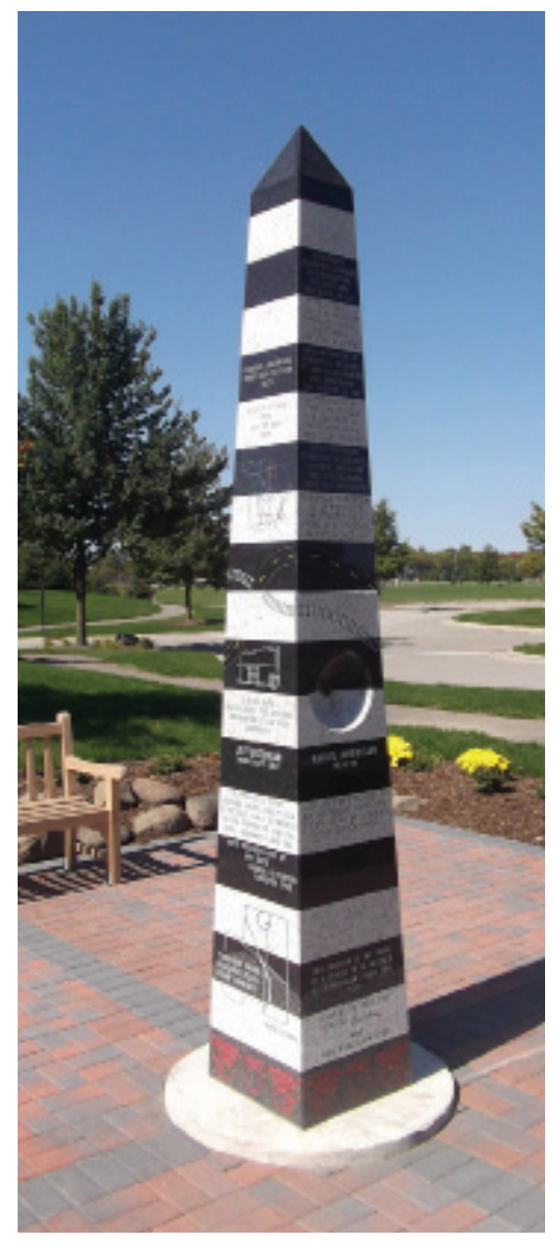
Sample of the Coasting the Baseline Obelisk as erected in Novi, Michigan.

After the United States acquired the Northwest Territory following the American Revolutionary War, Congress passed the Land Ordinance of 1785 to survey public lands in what would become the states of Ohio, Michigan, Indiana, Illinois and Wisconsin.