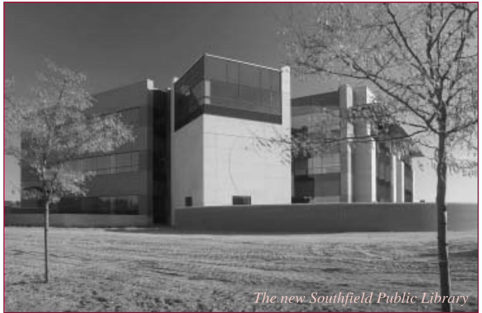
The new Southfield Public Library

Zyskowski: The new library is filled with a wide variety of interesting and engaging areas and points of interest around every corner. There are three outdoor terraces: "The Fountain Terrace" by the Library Café; the "Imaginarium Garden" near the childrens' Worlds of Wonder; and "The Observation Deck" on the second floor.